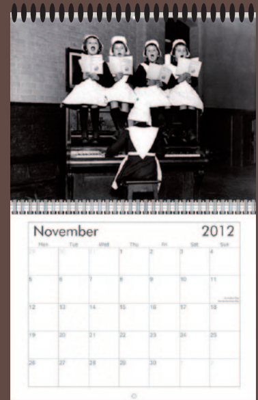
Actual item will be very similar but not identical to picture.

Brand new for 2012, this calendar has been created entirely from photos taken from our archives, dating back to the early 1900s. Each month depicts children playing, singing or getting ready for Christmas. It is a beautiful memento of our history and of times past, as well as a perfect Christmas gift for you and your friends. The calendar will arrive in a cardboard envelope ready to wrap.