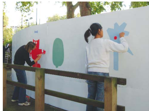
Royal Bank of Scotland volunteers transforming a children's play area at Coram.

I wonder if you know about a way you can give regular help that not only makes it easier for you to budget for your support, but also gives us more confidence to plan ahead?