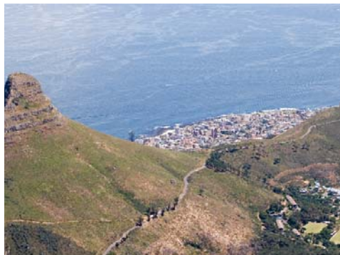
South Africa Cape Town.